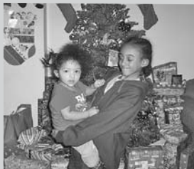
Waiting in front of the tree

us that she had received such a huge response from her co-workers that she wanted to adopt another family.