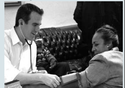
Doctor from the Manhattan House Call Program tests resident's blood pressure