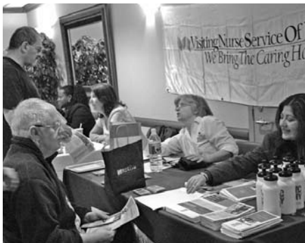
Clients talk to representatives from Visiting Nurse Services and Village Care of New York

community. Given the strong response, HSI is planning to make this an annual event and to find more ways to meet neighborhood needs.