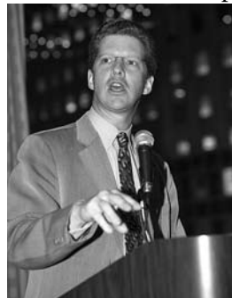
Above: Keynote speaker, HPD Commissioner Shaun Donovan.

The Board of Trustees of Housing & Services, Inc. is pleased to report that, thanks to all the efforts of the energetic gala committee and generous friends, the 2007 HSI The Road Home Gala was the most successful event in HSI history, raising over $360,000. This amount of unrestricted aid is critical, allowing HSI to continue to run its programs, filling in gaps where it